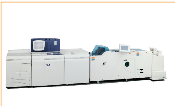
Printer + BME-x + SQE